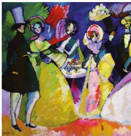
On the cover: Graphic elaboration of Group in Crinolines (1909) by Wassily Kandinsky; Solomon R. Guggenheim Museum, New York