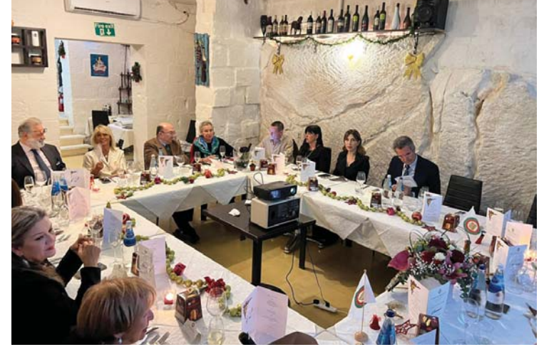
Good food is about to be served.

Some events had combined food with regional music when personalities from the music world participated and gave pleasure to the members. On other evenings doctors spoke about nutrition and a healthy diet while other talks were on