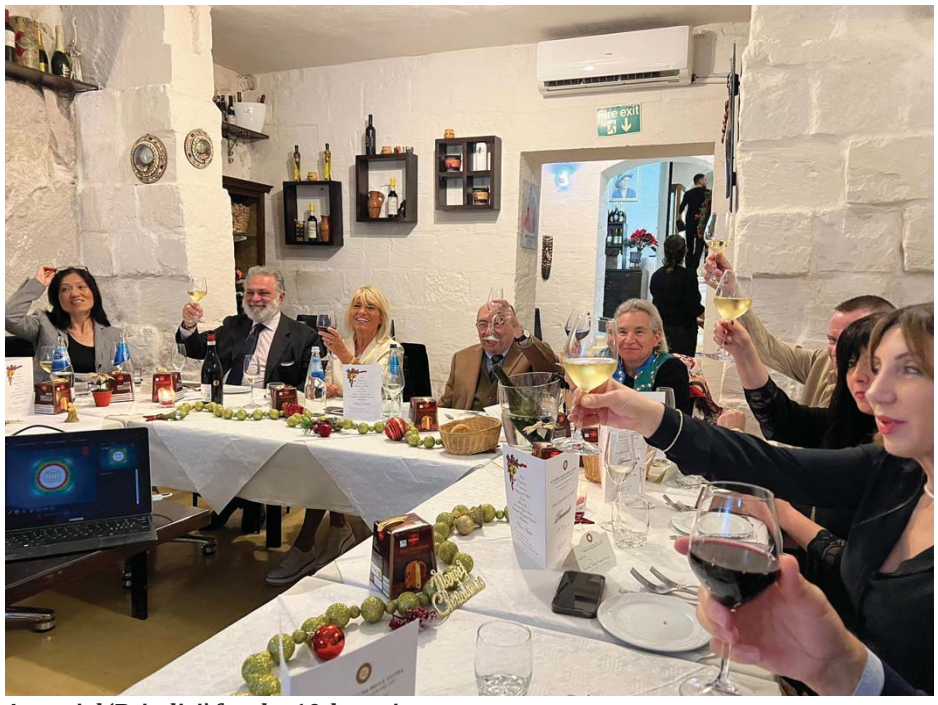
A special 'Brindisi' for the 10th anniversary