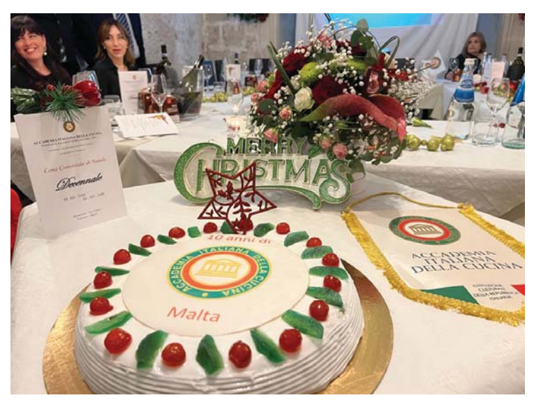
The celebratory 'torta' and a lovely display of flowers.